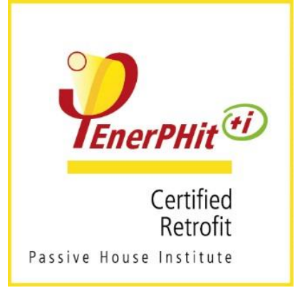
EnerPHit<sup>+i</sup> seal (for buildings with mostly interior insulation)