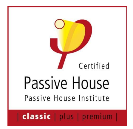
Passive House seal

Subject to a thorough quality check, buildings can be certified in accordance with the criteria for the respective energy standard as mentioned in Section 2. If the technical accuracy of the required documentation for the tested building is confirmed in accordance with Section 3.2. and the criteria in Section 2 are fulfilled, the respective applicable seal will be issued.